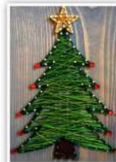
Example of completed project