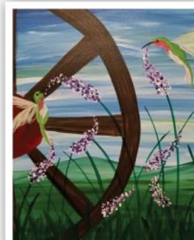
Example of painting shown above

Space is limited. Must be registered by February 26.